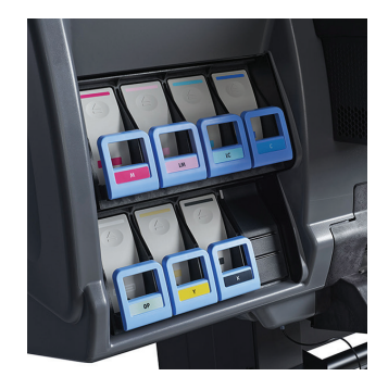
HP 831 Latex Inks

The HP Latex 360 Printer features a number of significant innovations that take you beyond the limits of eco-solvent printing, creating new opportunities to expand your business.