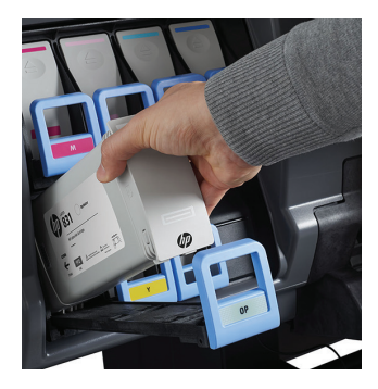
HP Latex Optimizer

Achieve high image quality at high productivity: