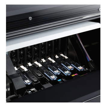
HP 831 Latex Printheads

• Interacts with HP Latex Inks to rapidly immobilize pigments on the surface of the print