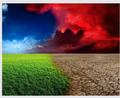
Saturation 'most' setting