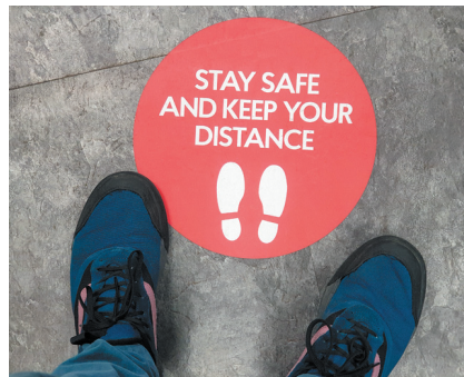
Decals & Stickers